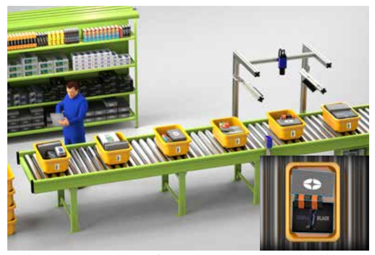
Datalogic vision systems running the IMPACT Pattern Sortation Tool enable countless machine vision applications for pattern recognition. The Pattern Sorting tool enables cross-check applications that ensure package contents match the information on the pallet or tote label.