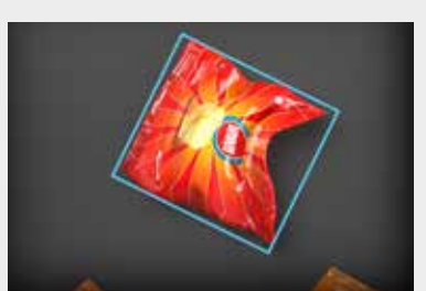
IMPACT Pattern Sorting Tool identifies and locates objects even in soft packaging such as chips, biscuits, frozen goods and pasta, enabling robot picking and sorting.